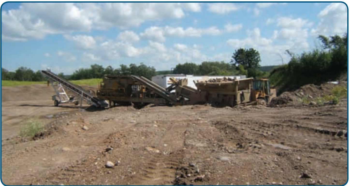
Rolling River Trucking's new rock crusher

The staff has always been there to provide support and professionalism.